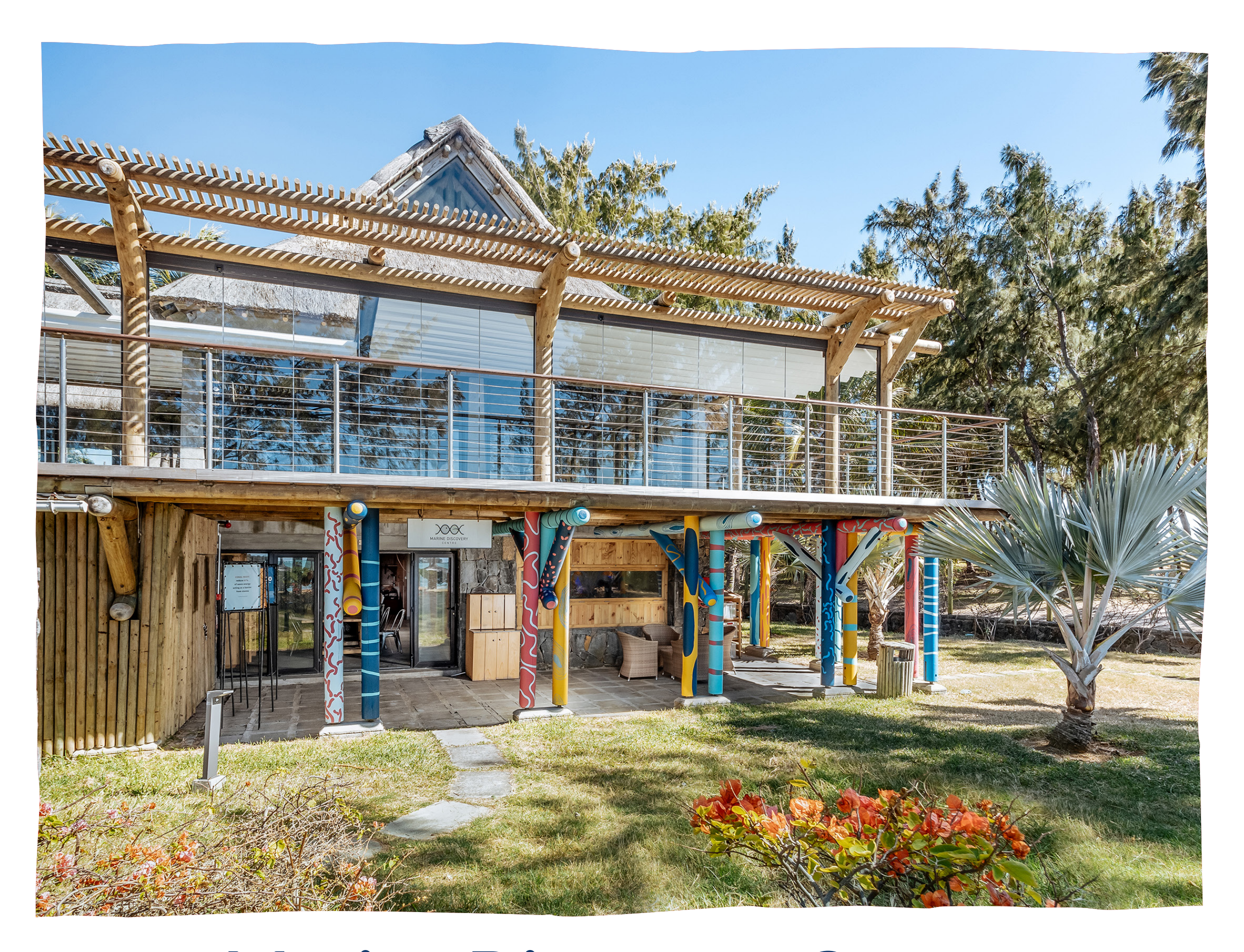
Marine Discovery Centre