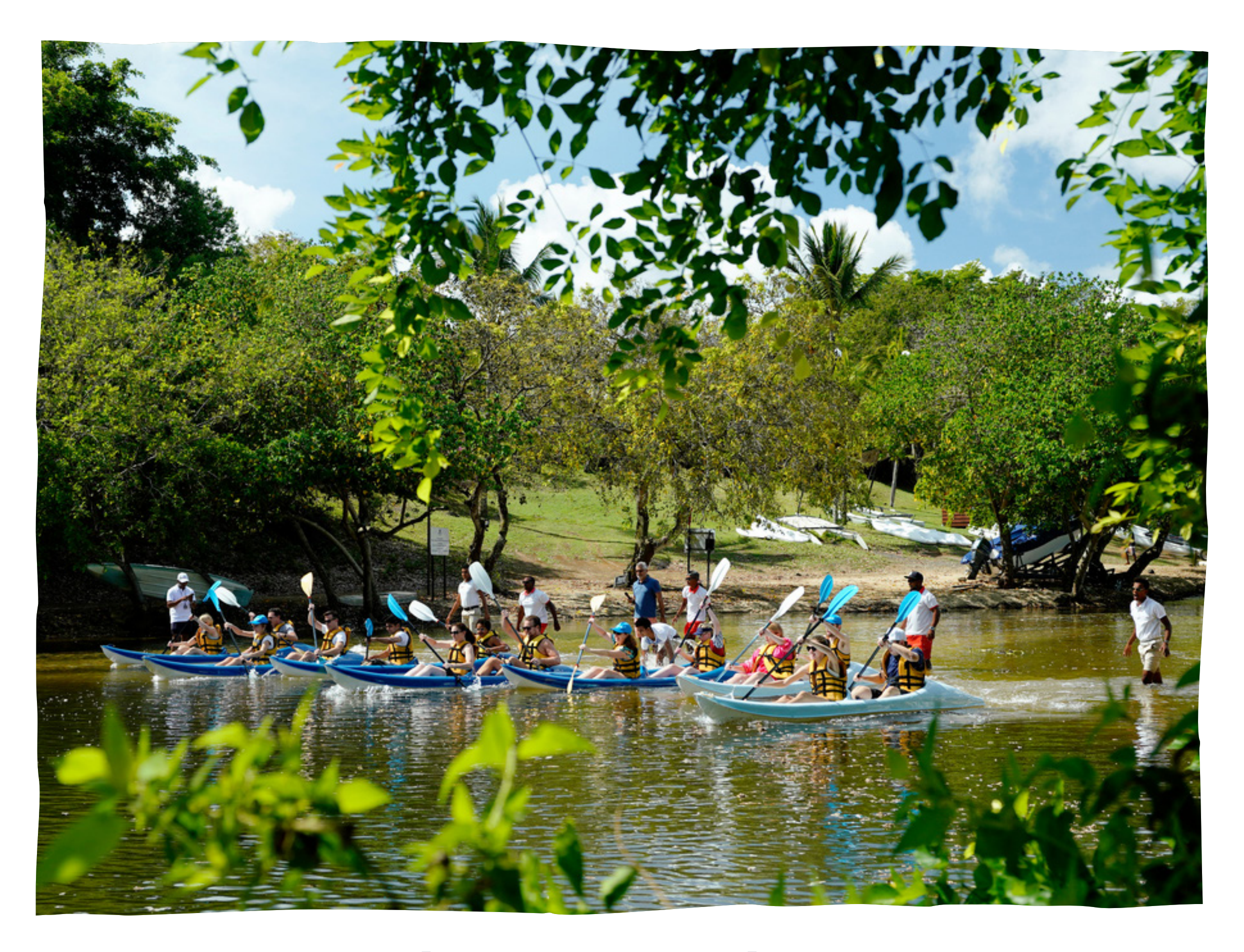
Kayak race on the river